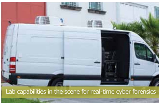
Lab capabilities in the scene for real-time cyber forensics