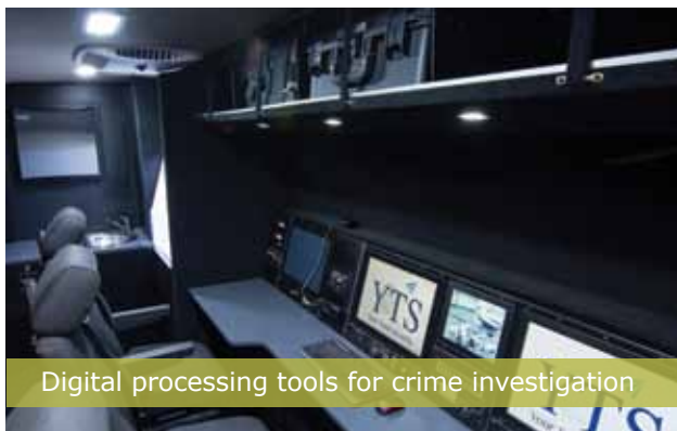
Digital processing tools for crime investigation