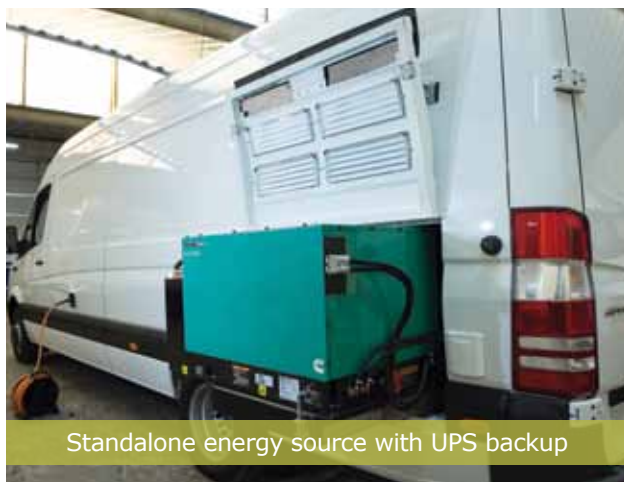
Standalone energy source with UPS backup