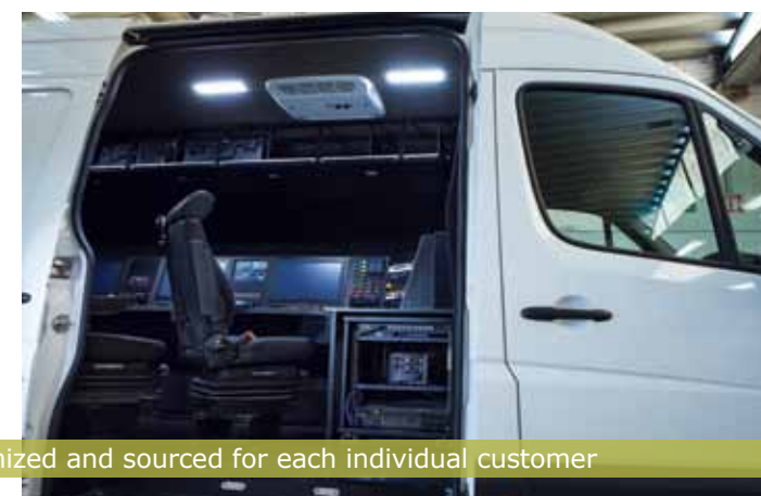
The right technology and equipment customized and sourced for each individual customer